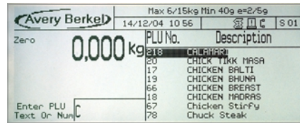
Informative dot matrix display. Example shows PLU search mode