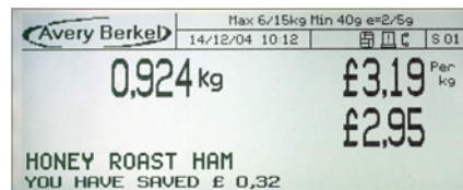
Promotional offers clearly displayed